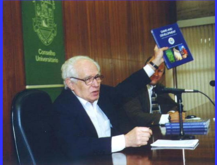
Prof. José Goldemberg