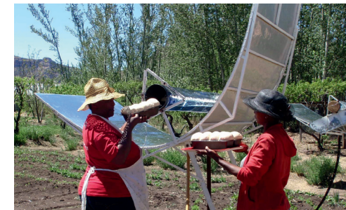
Solar Bakery, Lesotho.

Working areas range from favourable framework conditions to inclusive business models or the contribution of certain technologies to a sustainable energy development path. GFSE then draws, documents and shares relevant insights with key stakeholders to help achieve a more sustainable energy system worldwide.